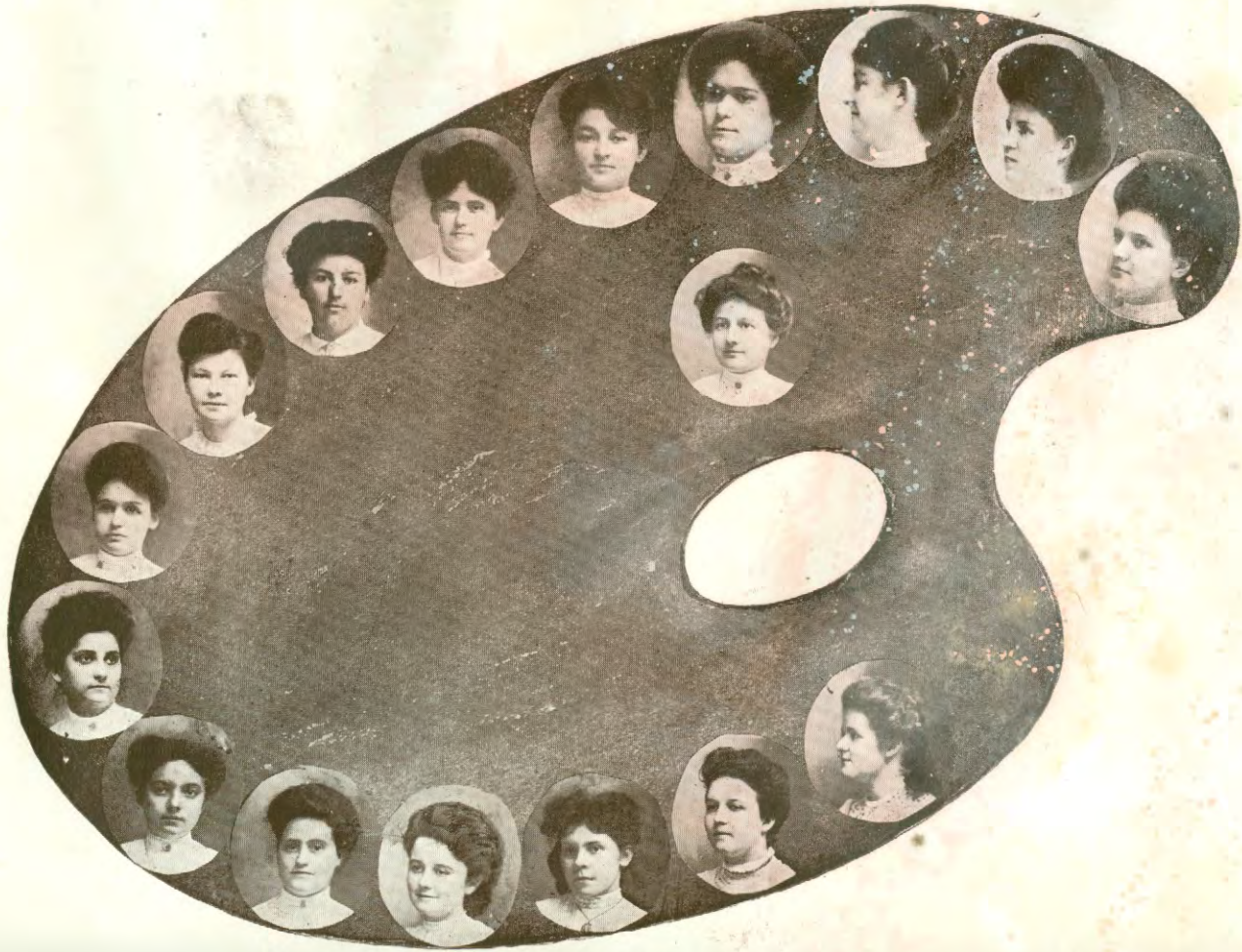
THE ART CLASS.