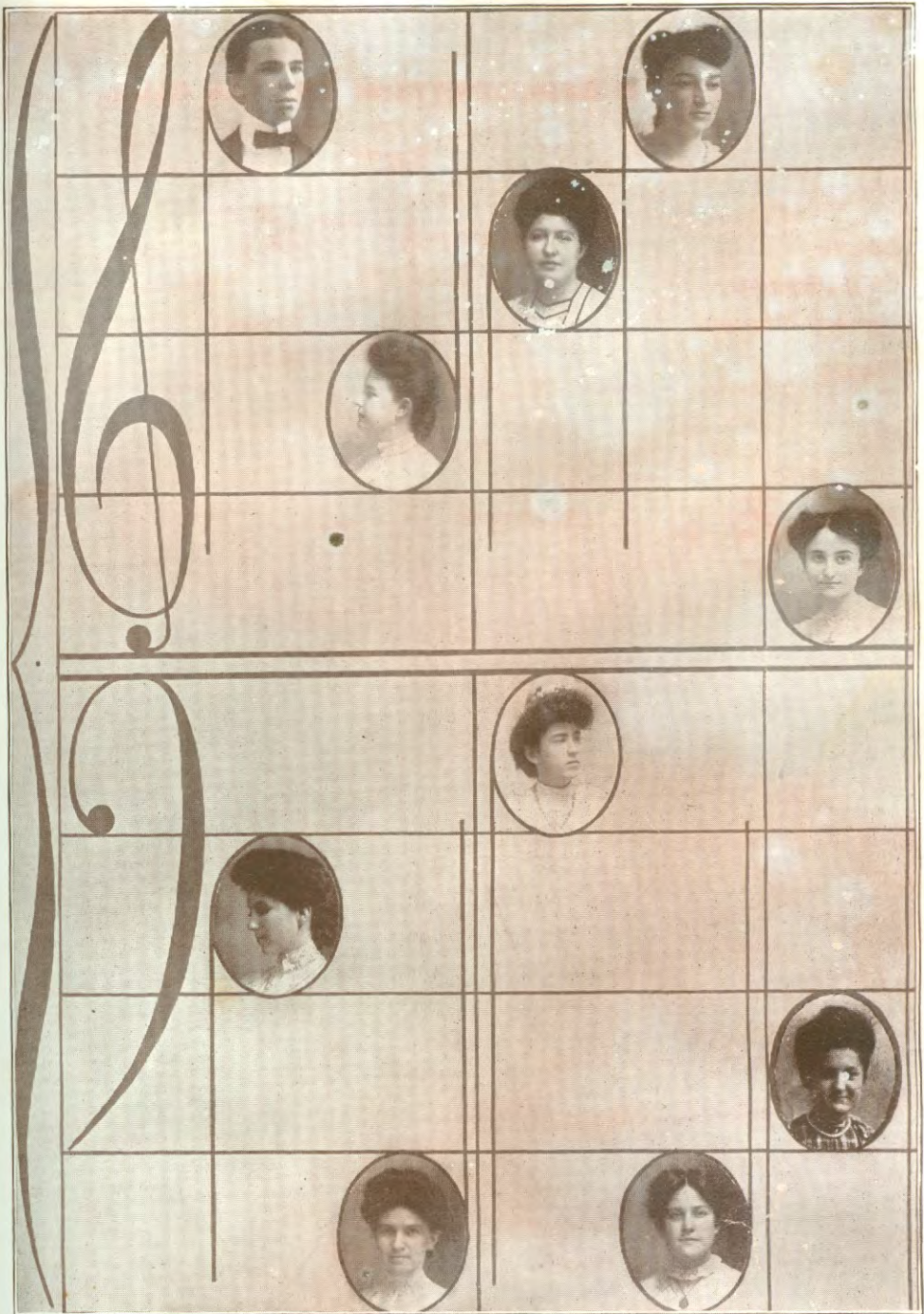
THE OSSIP GABRILOWITSCH MUSICAL CLUB.