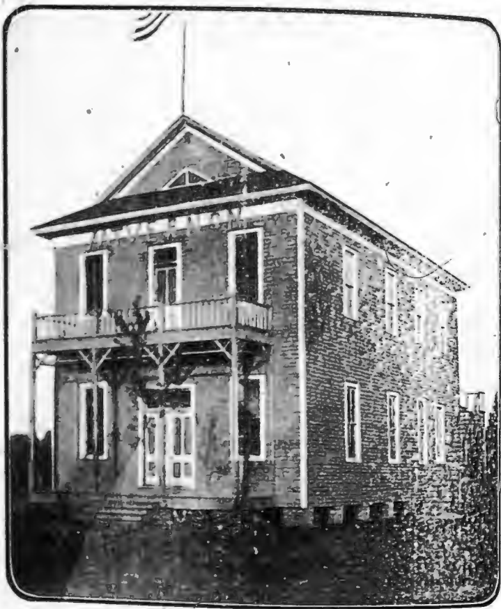
MOUNT VERNON HIGH SCHOOL.