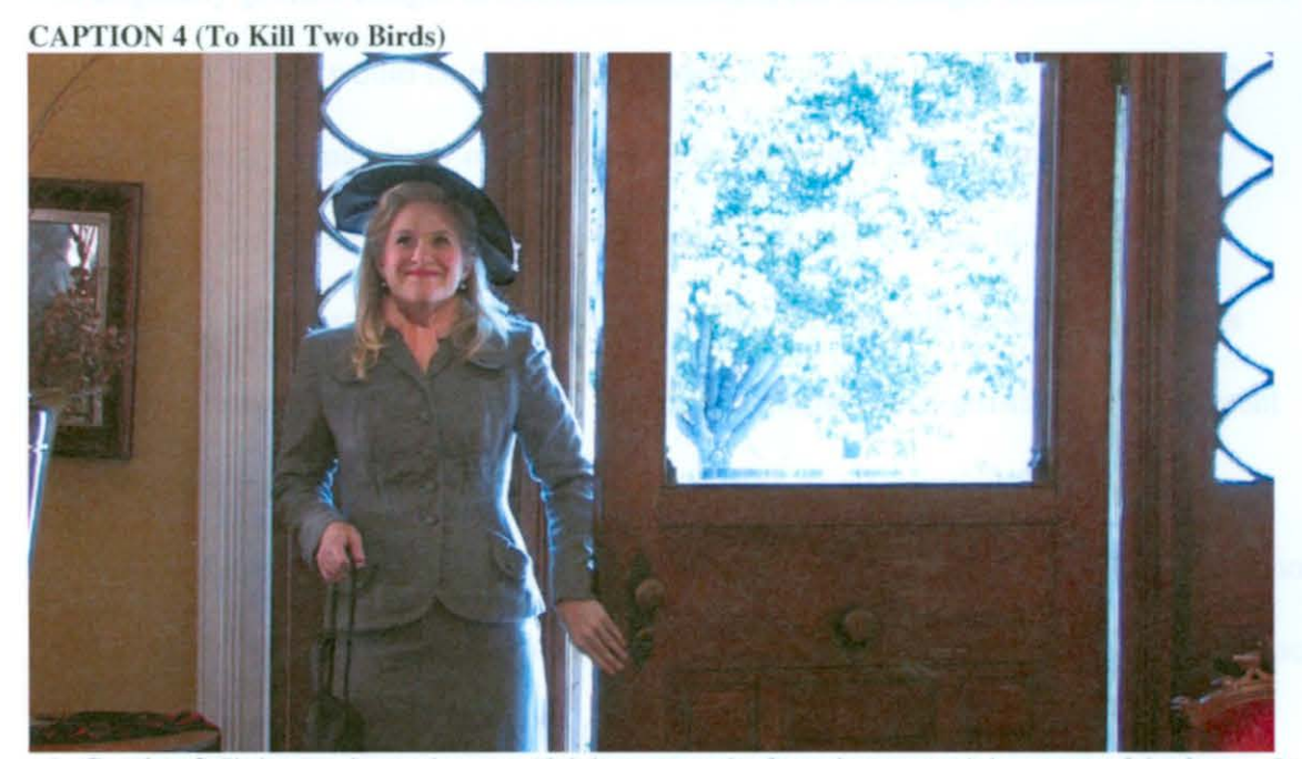
In Caption 3 Christmas decorations are plainly seen on the front door toward the center of the frame. In Caption 4, taken from a scene shot three months prior, there is not even a hint of the garland that is draping either side of the door in Caption 3.