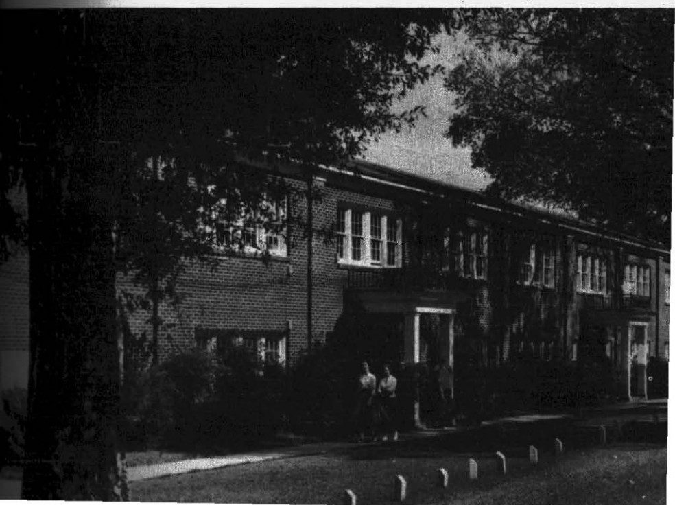
Ernest Bailey Hall