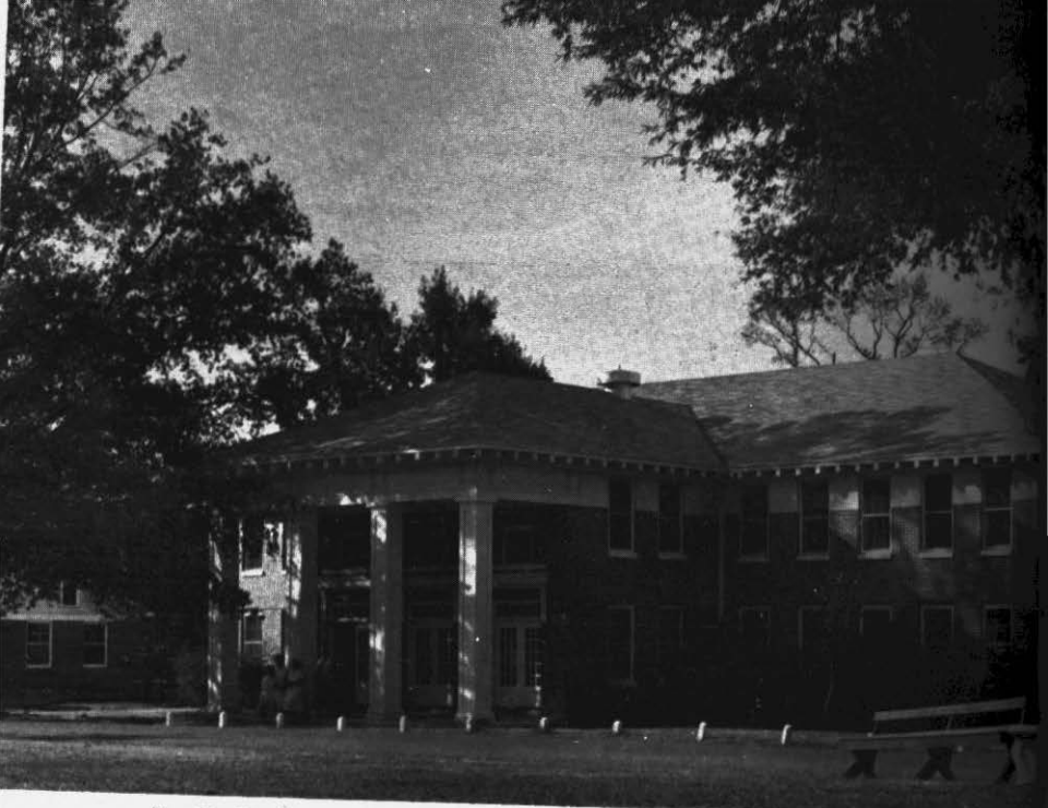
R. C. Daily Hall