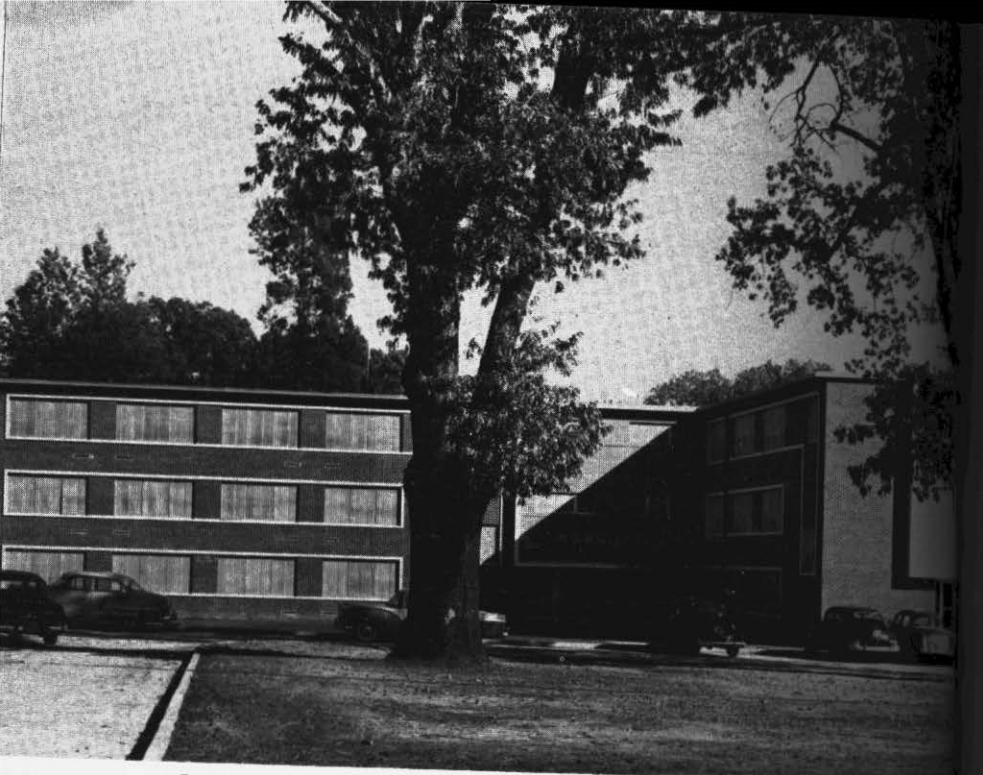
O. C. Bailey Hall