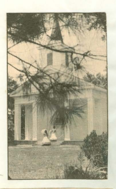
Old Methodist Church