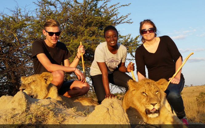
The Zimbabwe Recruitment team enjoys a well-deserved break at Antelope Park near Gweru, Zimbabwe.

One of the top ways that international students find out about Ouachita is through the recommendation of our alumni. We're grateful for the assistance of those mentioned above.