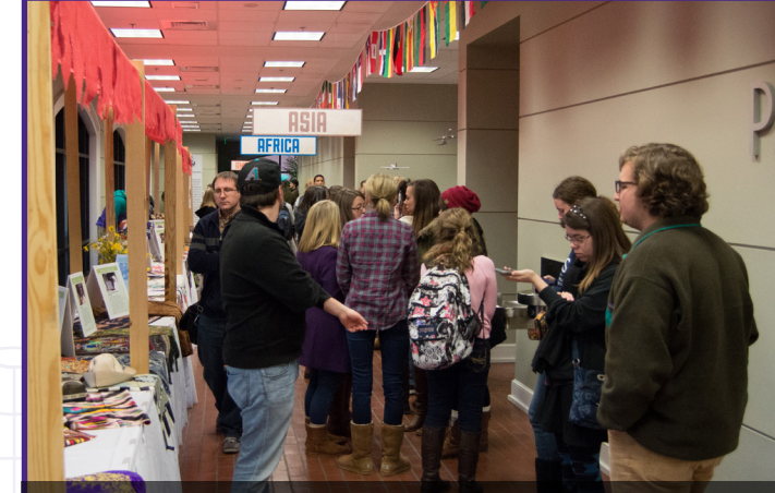
Students and guests explore the World Market at the International Food Festival.