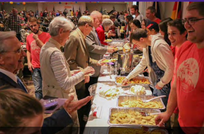
More than 600 faculty, staff, students and guests participated in the 2016 International Food Festival in Walker Conference Center.